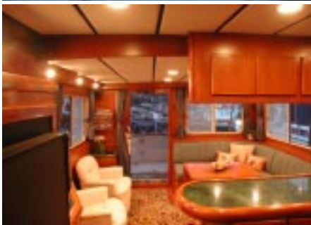
Above Top: Eagle 53 Flybridge Above: Salon looking aft Below: The luxurious dining area