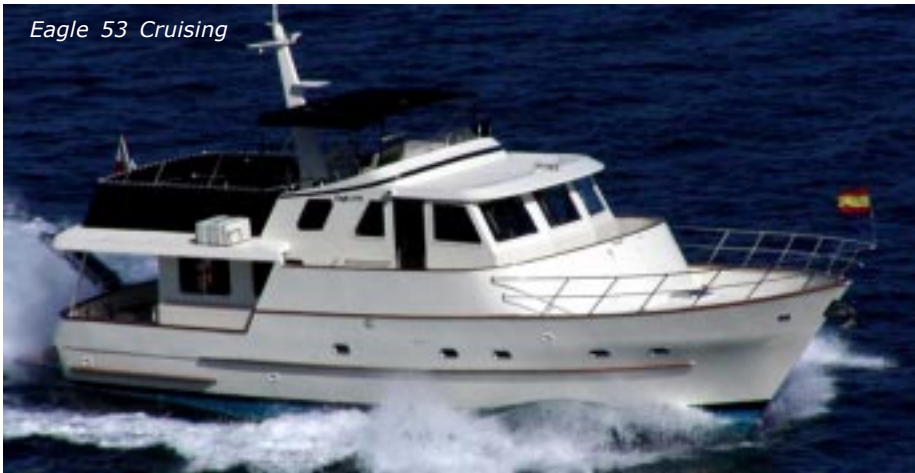
Eagle 53 Cruising