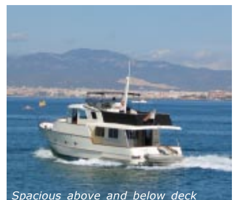
Spacious above and below deck