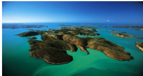
Buccaneer Archipelago Kimberley Region WA North West

For more information go to www.sailaroundaustralia.com.au